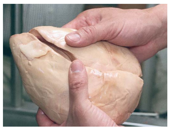
This grade-A duck liver has a good, clear color and a desirable texture—firm but slightly supple, with no trace of sponginess. The author carefully pries apart the two lobes in preparation for deveining and slicing.

Quick, high heat for sautéing. Sautéing foie gras is by far the most simple way to prepare it. Nonetheless, while the cooking is accomplished in a matter of minutes, you must use your sense of touch to identify the precise moment when the liver is fully cooked but not overcooked. As foie gras cooks, a lot of fat is rendered off so the slices go from cold, firm slices that are full of solidified fat to softer, springier slices that have had much of the fat cooked off. As you cut your