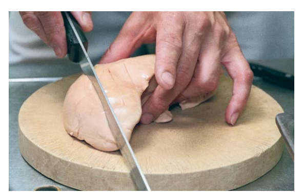
A hot, thin knife and careful measuring yield neat slices and no waste. The author cuts the liver fairly thick because it shrinks during cooking. It's important to work quickly to keep the liver cool and unmelted.